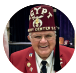
Board of Directors Dale Province