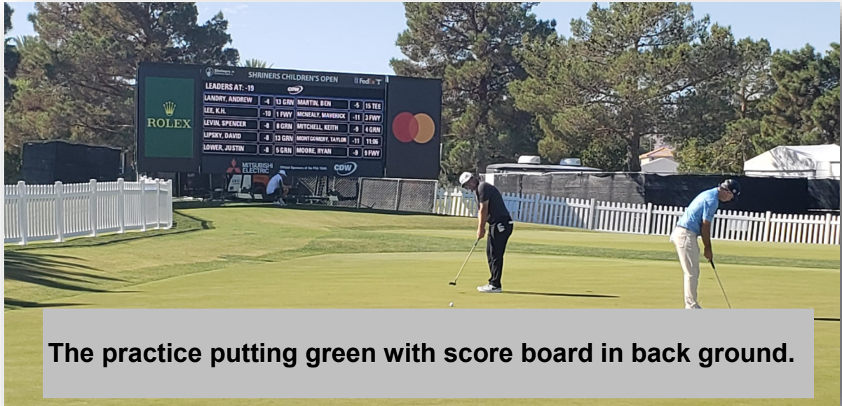
The practice putting green with score board in back ground.