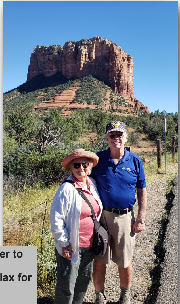
They went over to Sedona and Phoenix to relax for a few days.