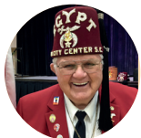
Board of Directors Dale Province