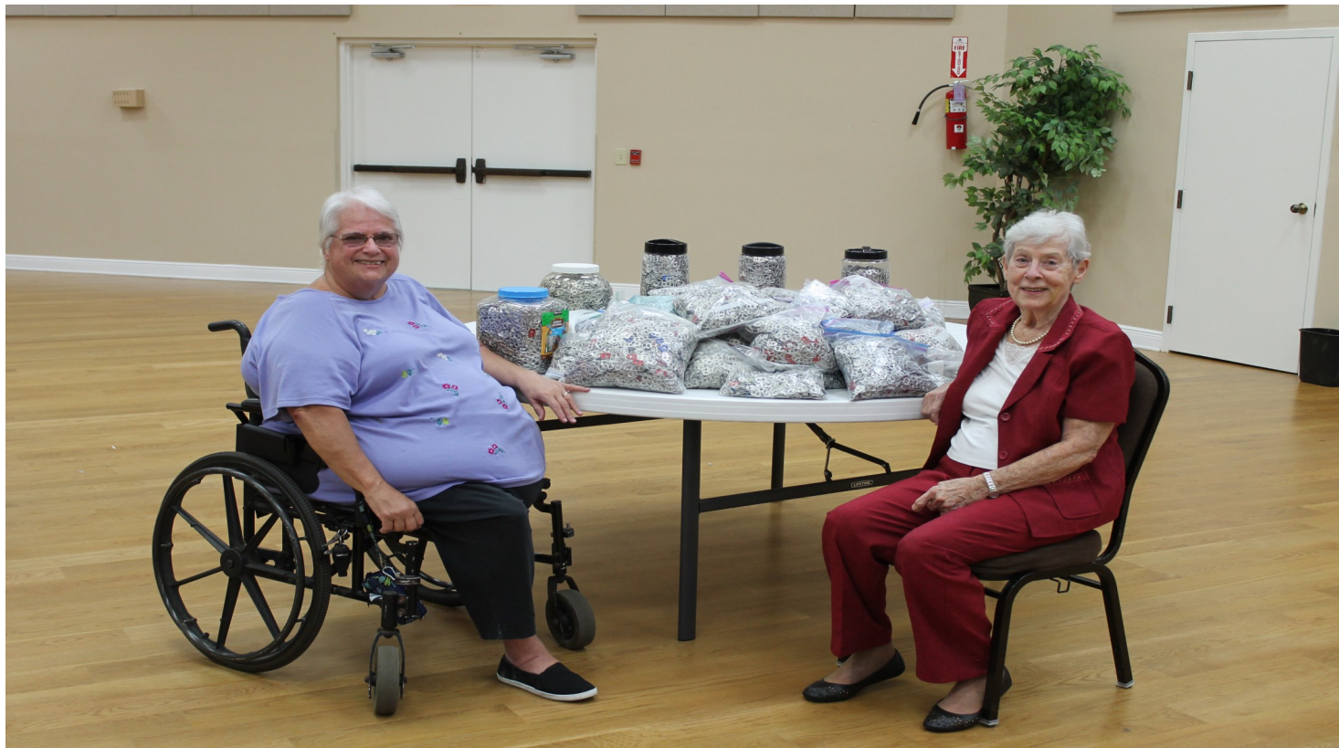
PULL TAB DONATION FOR CHILDRENS HOSPITAL