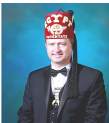
Illustrious Sir James Lich Potentate 2017