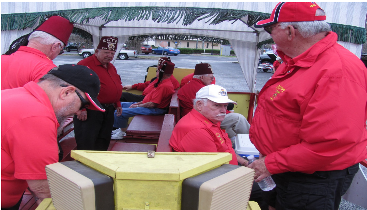
Strawberry Festival Parade