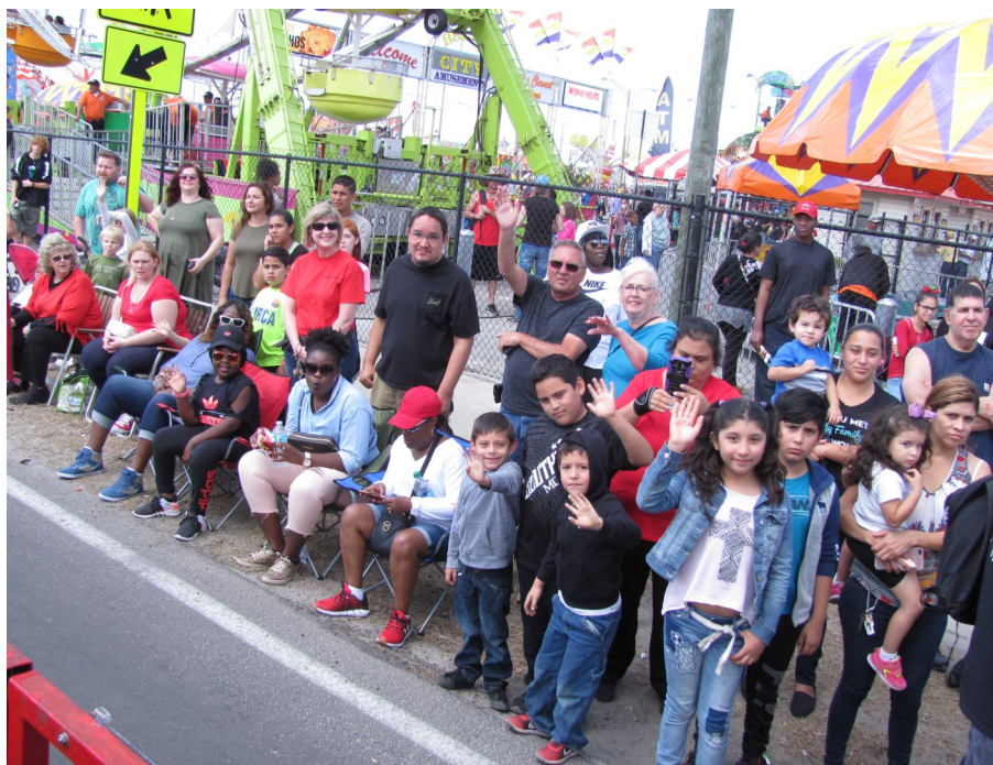
Strawberry Festival Parade spectators