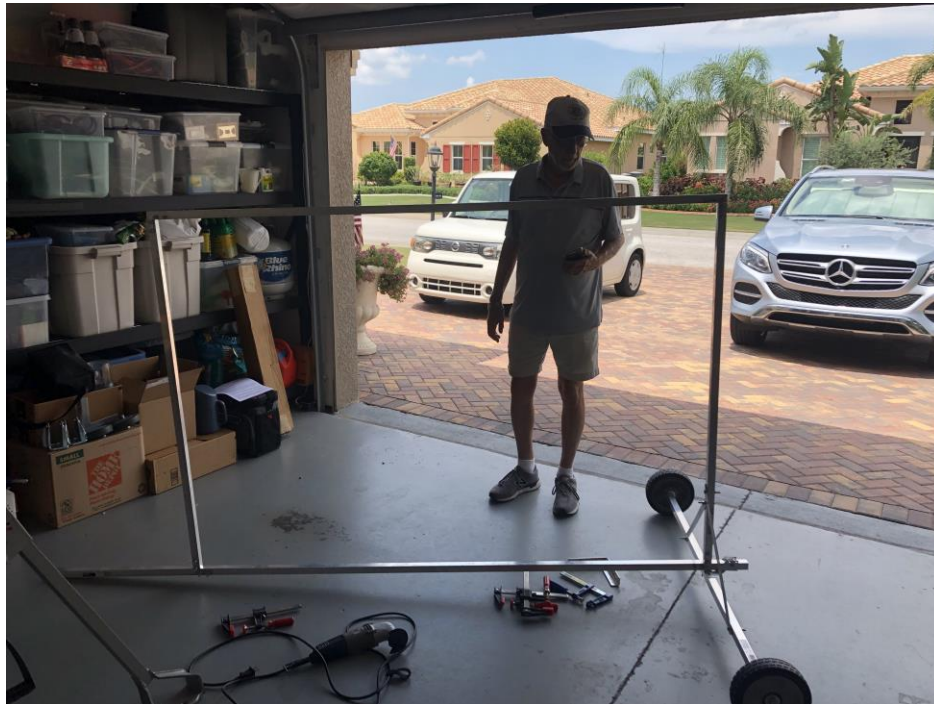
Original Construction 2019